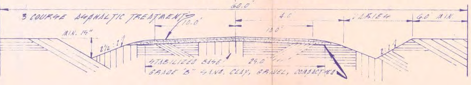
TYPICAL ROAD SECTION